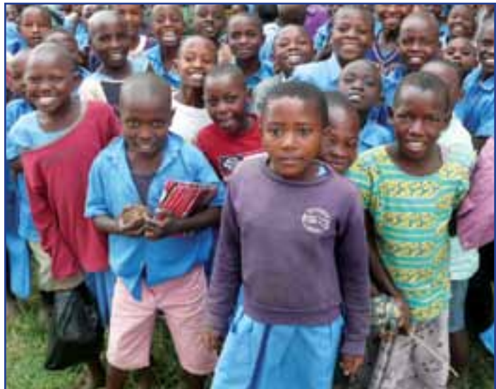
Pupils at Kyarukumba Primary School in Ibanda.

The majority of adults and many girls, especially those in school, know that some cancers affect only women, and many referred to cancer of the uterus or womb. A wide variety of terms exist in local languages to refer to the uterus or womb, but there is no specific terminology to refer to the cervix. As a result, uterine cancer and cervical cancer were often confused in interviews. As one mother in Masaka said, “Cancer of the cervix? We thought it was the same as that of the uterus. In both cases the uterus is affected.” Some health workers reported attempting to explain the difference to patients by referring to the cervix as the “mouth of the womb.” Most study participants, however, did not readily recognize this terminology when asked. It ultimately became clear that most people other than health workers identify cervical cancer by its symptoms and not by its specific anatomical location (see next page). Once a common understanding of the terminology was established between researchers and study participants, most people said that cervical cancer is a serious problem, and many cited instances of family members or acquaintances being affected. This included health workers, who perceived the condition as serious in spite of the fact that very few data on burden of disease are available.