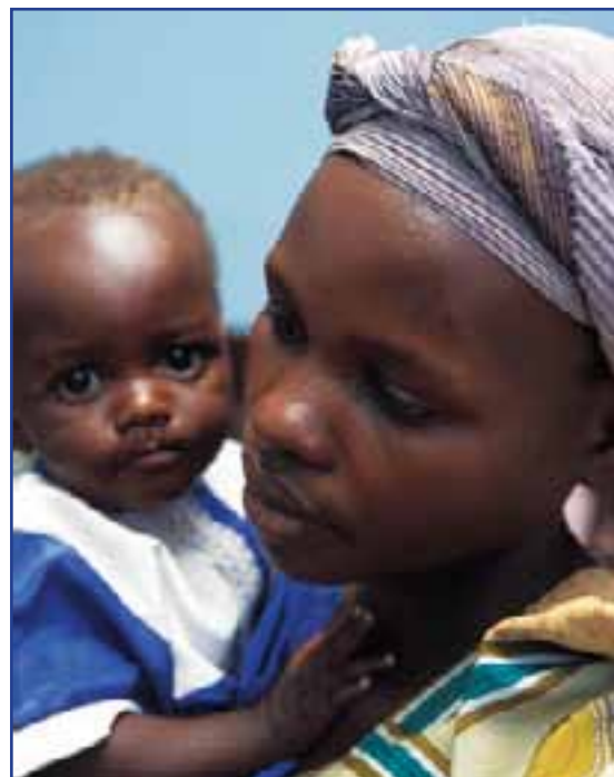
A woman and her baby in Namukanaga, Uganda.

It is estimated that every year, approximately 40 women in every 100,000 develop cervical cancer in Uganda. 21 However, very little data are available regarding burden of cervical cancer overall, and the accuracy of available data is uncertain due to collection and reporting limitations in health facilities. That said, available data show that cervical