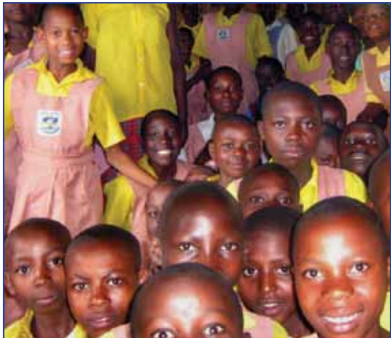
Primary school pupils in Ibanda.

National-level policymakers in particular strongly supported the idea of integrating the HPV vaccine into the government’s Child Days Plus program, which targets all children aged 14 and younger. During April and October each year, Child Days Plus delivers an integrated package of preventative services (e.g., catch-up immunizations, vitamin A supplementation, and deworming medicine) through schools, health units, and other outreach centers including churches, community centers, and local council offices. A 2006 review of Child Days Plus found that the program covered a wide population of children in