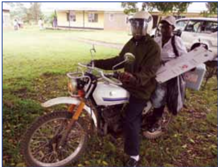
Members of the HPV vaccination team transporting the vaccines to schools in Ibanda.

A number of gaps were identified which need to be addressed, however. For example, there is inadequate capacity to store HPV vaccines at both national and some district levels. Even in districts where sufficient refrigerator space exists, some equipment is broken and requires repair. Additionally, at the district level, gas cylinders are often required to run the refrigerators during frequent power outages, and shortages of the cylinders were noted. There is also inadequate freezer capacity for the ice packs required to transport the vaccines from district health centers to schools and community locations, and Kampala district does not have a dedicated vehicle for such transport. Funding shortages for health at the national level have previously presented obstacles to vaccine storage and delivery in the districts, including by causing stockouts or delays in Child Days Plus activities. Such challenges have been exacerbated by the fact that the number of districts in Uganda has increased from 50 to 80 since 2004.