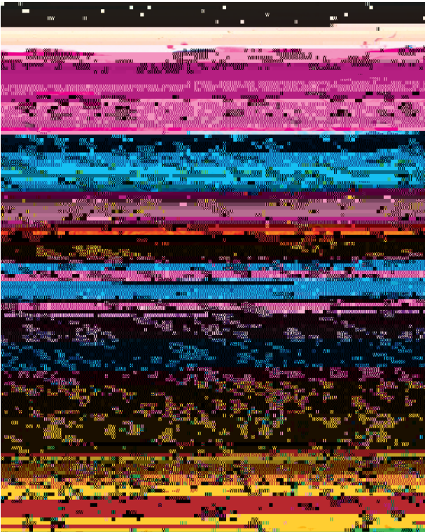
Figure 6 High-grade cervical intraepithelial neoplasia